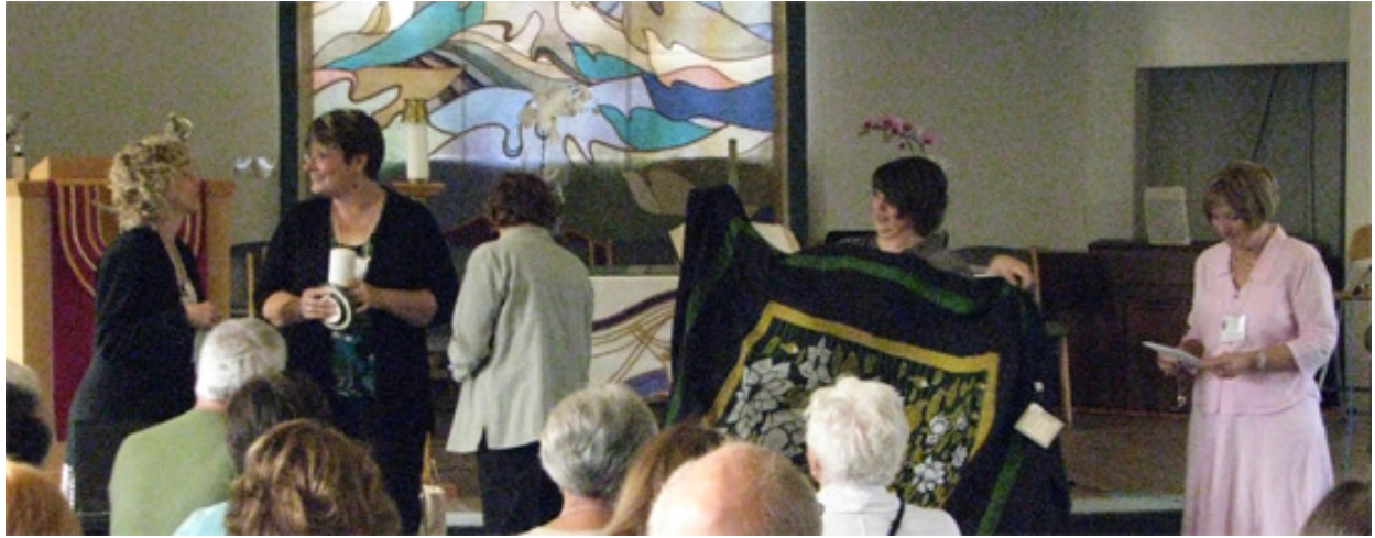
Called to pray, one for another in ministry.

Call to Worship One: Sisters and brothers God is here among us. All: Praise be to our God who calls and equips us for the work of the Church. One: Friends by the Spirit, we raise our voices united in our common ministry.